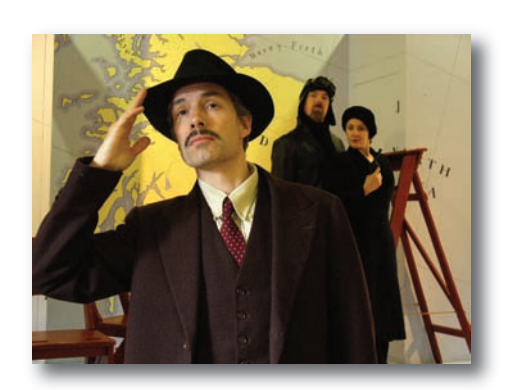
Hannay pulls it off!

"This may be small-scale theatre in rural venues, but there is certainly nothing small-scale about the talent and ambition which goes to make up North Country Theatre, nor about their ability to deliver a great night out." Lancaster Guardian